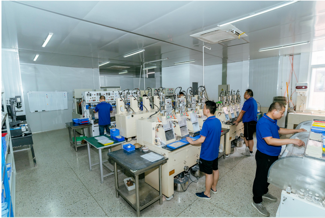
Lenses Polishing Machine* 20 sets