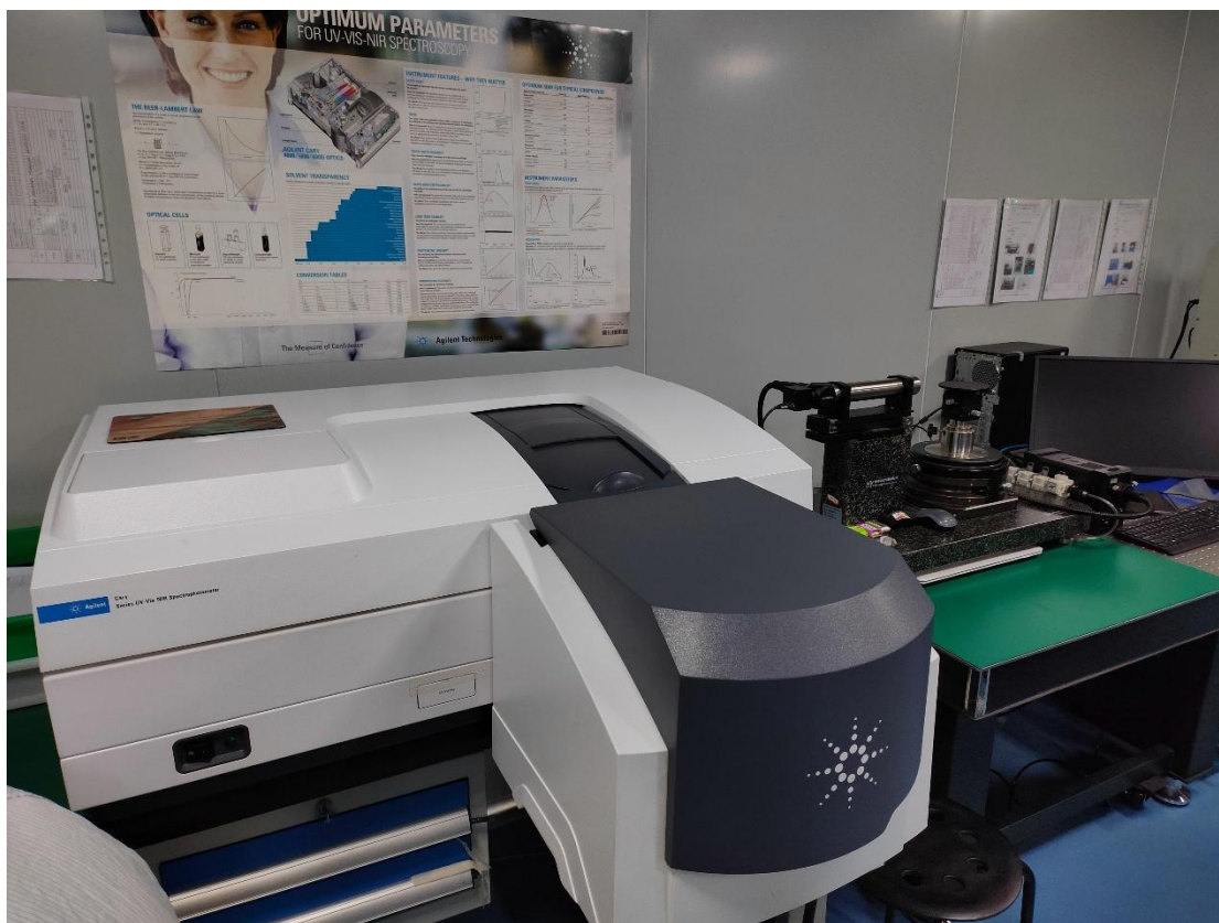
Transmittance and refractive index testing by AGILENT Spectrophotometer* 1