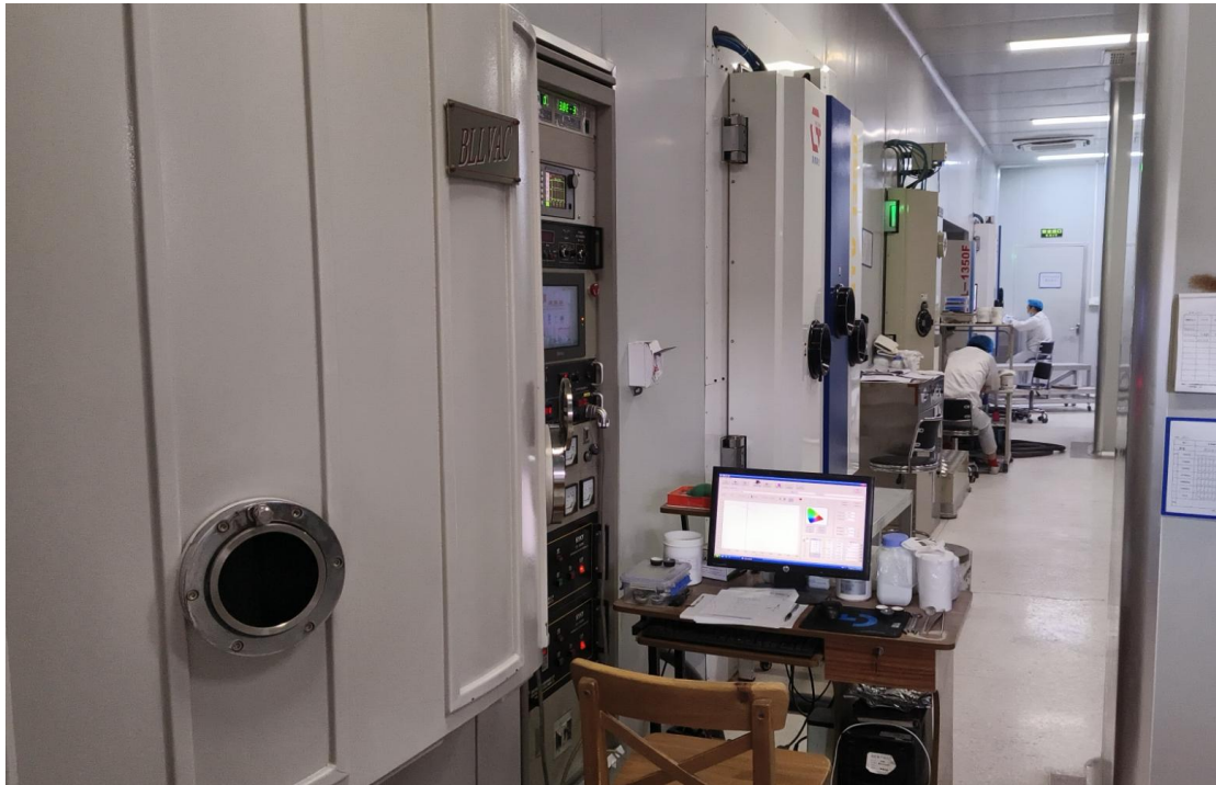
Vacuum Coating Machine*5sets