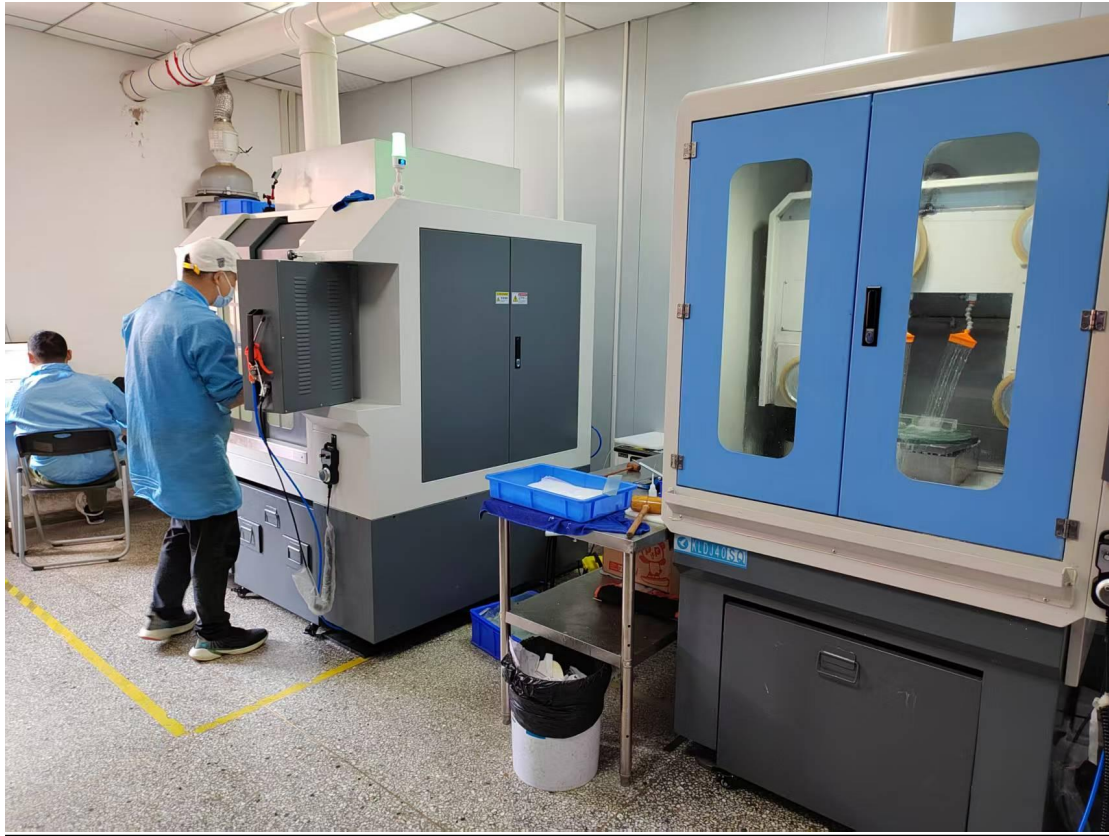
CNC blanking*3 sets, Wire Cutting Machine* 1