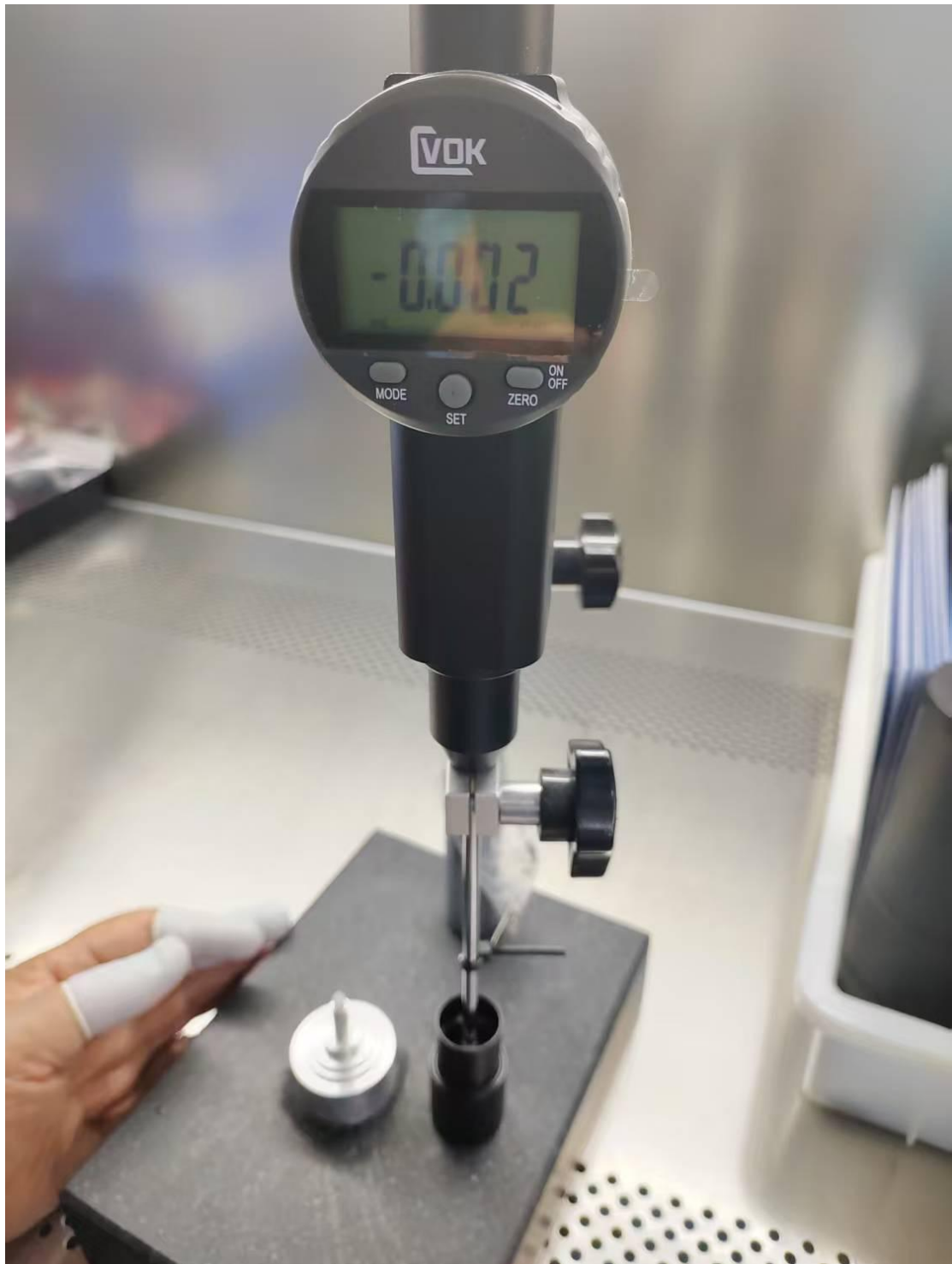
Axis Z test*3 sets