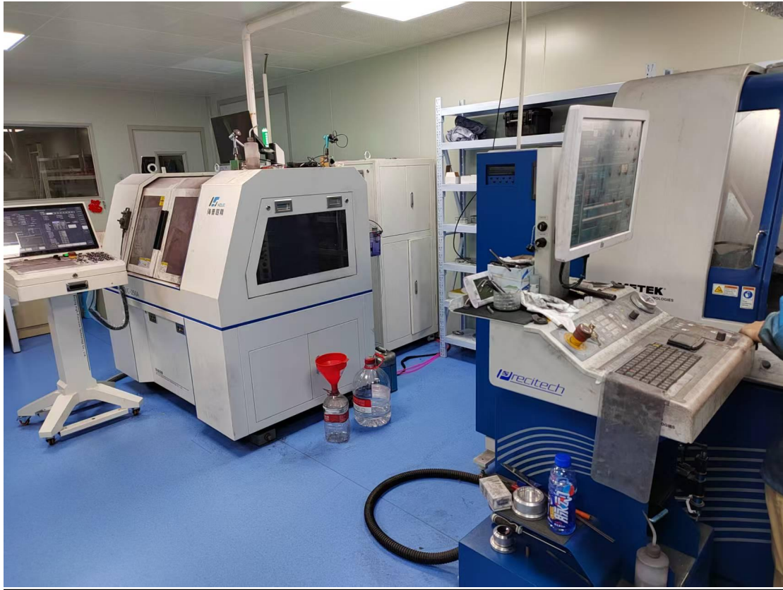
Diamond Single-point Turning Machine