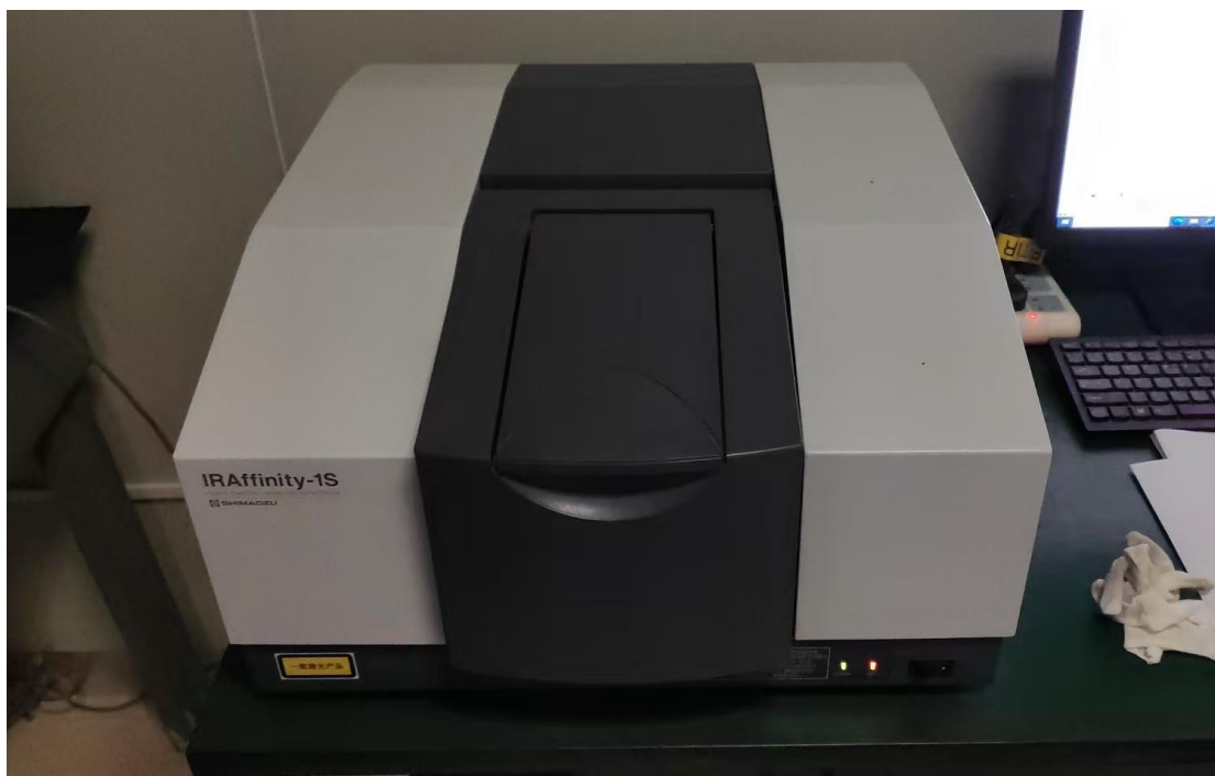
IR Spectrophotometer by Shimadzu