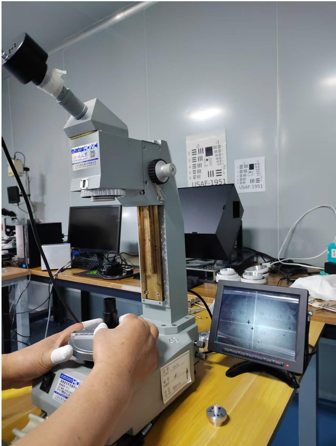
Axis X&Y test*1