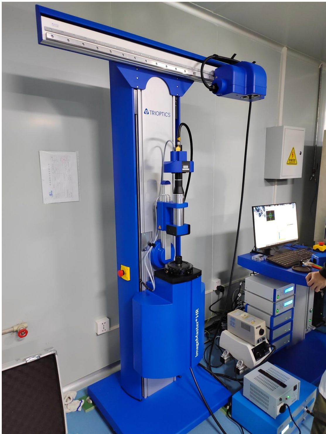
Imaging Quality test by MTF Trioptics*1