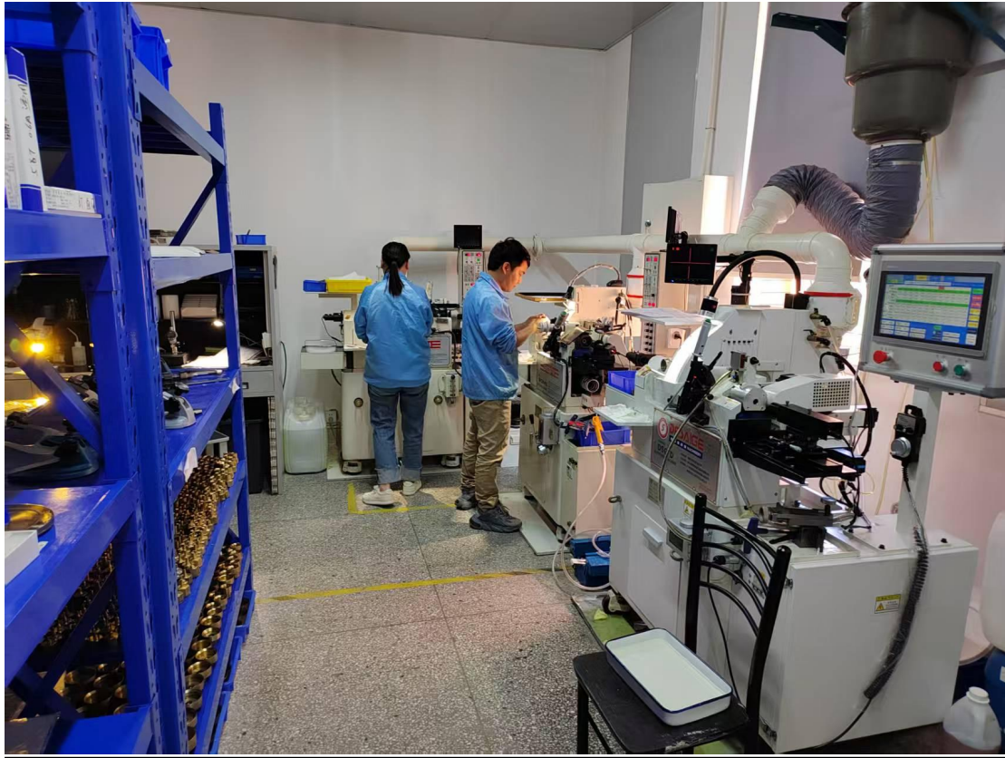
Centering Machine* 3 sets