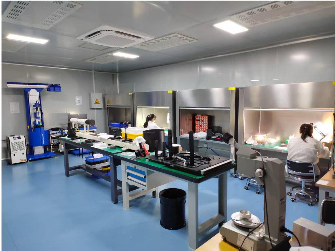
Lens Assembly and Inspection