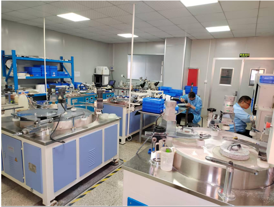
Polishing Machine* 8 sets, Workshop of Prisms, Windows&Mirrors